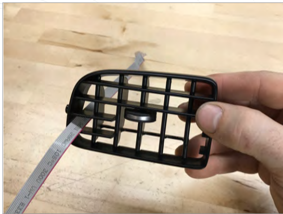
5 Feed ribbon cable through slats as shown.

For additional install information please visit www.p3gauges.com/install