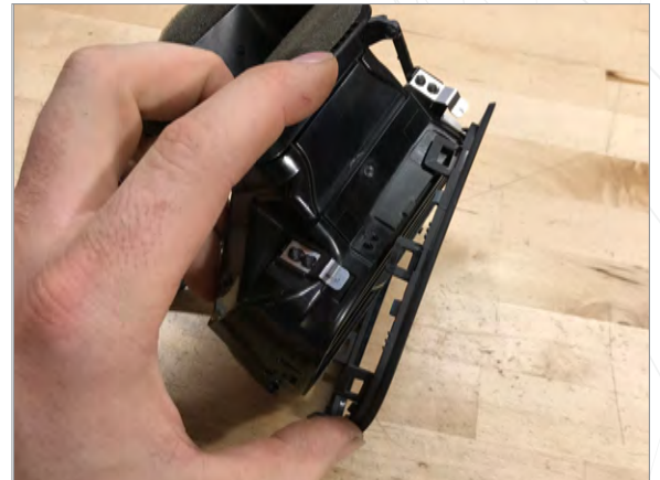
13 Reinstall trim on to vent housing.

WARRANTY & LIABILITY: Neither P3 Cars, nor its dealers or agents shall be liable in any way, for any damage, loss, injury or other claims, resulting from the installation or use of this product. By purchasing or installing this product, you assume all liability of any kind connected with the use and/or application of this product. If you are unsure that you can safely install and use this product, consult a qualified installer or mechanic. The warranty on this product covers only the product itself for a period of 6 months from the date of purchase, and it will be at our discretion to repair or replace the affected parts. No user serviceable parts inside. Warranty will be voided if product shows physical damage.