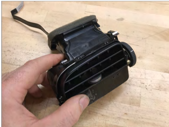
12 Reinstall slat assembly into vent housing.