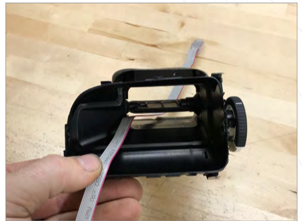
8 Feed cable through vent housing as shown.

WARRANTY & LIABILITY: Neither P3 Cars, nor its dealers or agents shall be liable in any way, for any damage, loss, injury or other claims, resulting from the installation or use of this product. By purchasing or installing this product, you assume all liability of any kind connected with the use and/or application of this product. If you are unsure that you can safely install and use this product, consult a qualified installer or mechanic. The warranty on this product covers only the product itself for a period of 6 months from the date of purchase, and it will be at our discretion to repair or replace the affected parts. No user serviceable parts inside. Warranty will be voided if product shows physical damage.