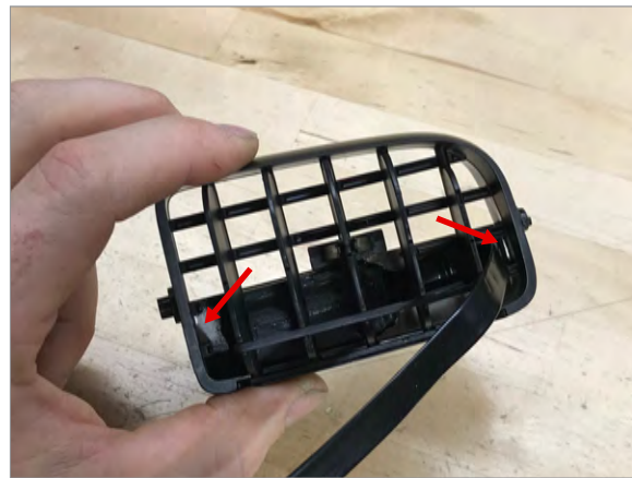
7 Glue display into place by placing glue on both tabs where shown.