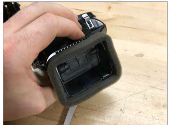
11 Fold ribbon cable around back of vent housing and glue foam back in to place.