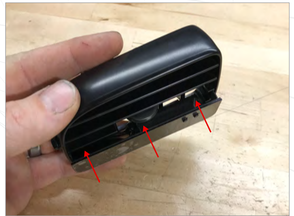
6 Install display into slat assembly ensuring that tabs are lined up correctly