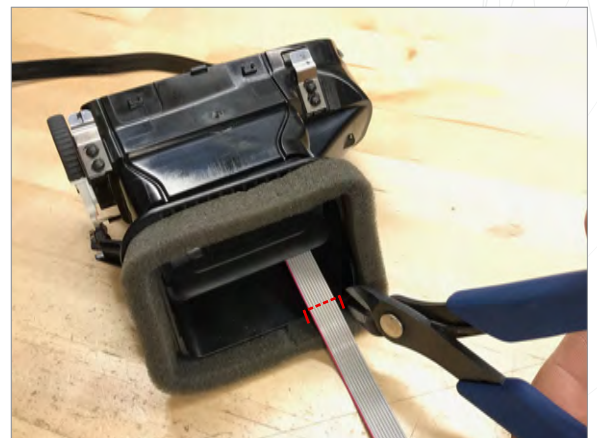
10 Cut relief for ribbon cable in back of vent.