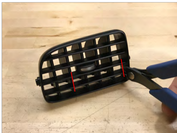
4 Use side cuts to remove bottom two slats as shown.

WARRANTY & LIABILITY: Neither P3 Cars, nor its dealers or agents shall be liable in any way, for any damage, loss, injury or other claims, resulting from the installation or use of this product. By purchasing or installing this product, you assume all liability of any kind connected with the use and/or application of this product. If you are unsure that you can safely install and use this product, consult a qualified installer or mechanic. The warranty on this product covers only the product itself for a period of 6 months from the date of purchase, and it will be at our discretion to repair or replace the affected parts. No user serviceable parts inside. Warranty will be voided if product shows physical damage.