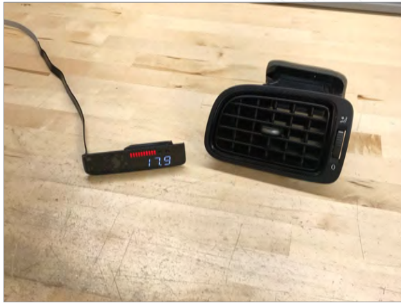
1 Remove vent from vehicle.