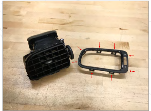
2 Use a small screwdriver to release 8 clips holding trim piece to housing.