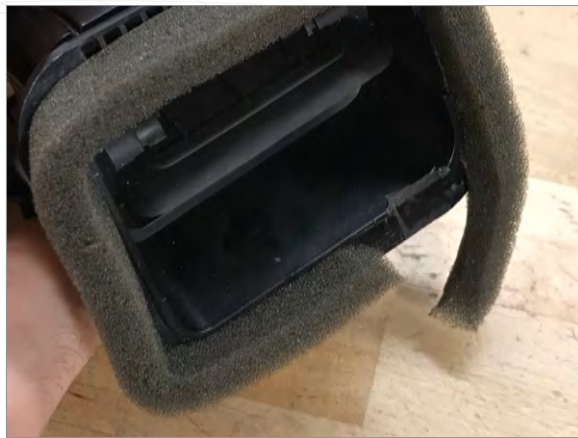
10b Pull foam away from vent as shown.

For additional install information please visit www.p3gauges.com/install