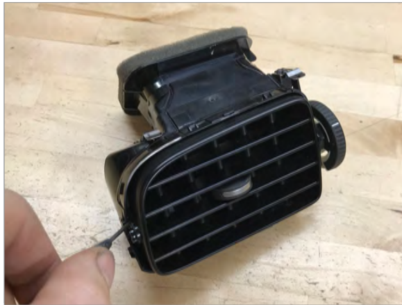
3 Use a screwdriver to remove vent slat assembly from vent housing.