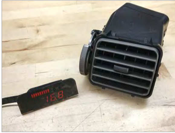
1 Remove vent from vehicle.