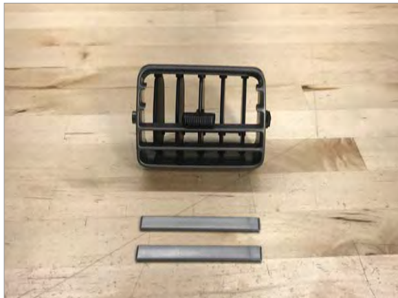
3b Remove top two vent slats from the assembly.

WARRANTY & LIABILITY: Neither P3 Cars, nor its dealers or agents shall be liable in any way, for any damage, loss, injury or other claims, resulting from the installation or use of this product. By purchasing or installing this product, you assume all liability of any kind connected with the use and/or application of this product. If you are unsure that you can safely install and use this product, consult a qualified installer or mechanic. The warranty on this product covers only the product itself for a period of 6 months from the date of purchase, and it will be at our discretion to repair or replace the affected parts. No user serviceable parts inside. Warranty will be voided if product shows physical damage.