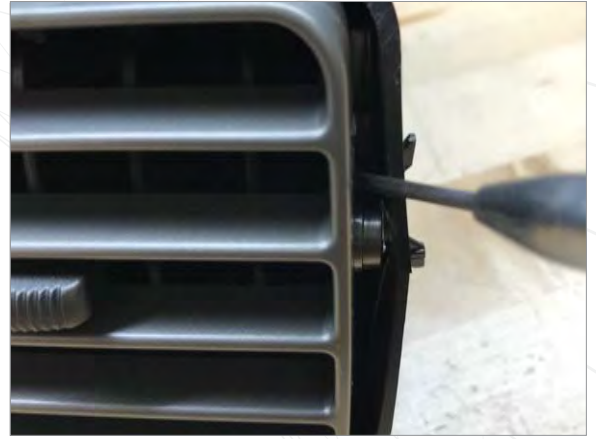
2a Use a small screwdriver to pry the vent slat assembly out of the housing.