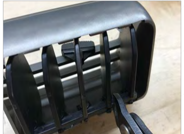
4 Cut the vertical slat connector where shown.