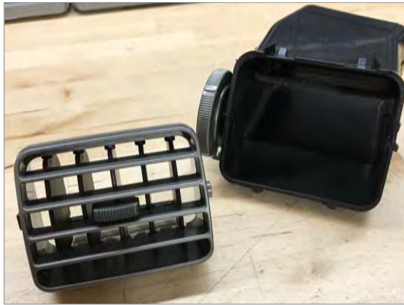
2b Remove vent slat assembly from vent housing.