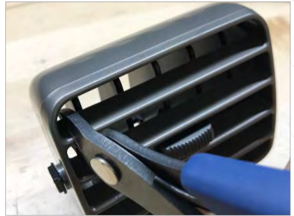
3a Cut the top two slats out approximately 1/8th inch from the edge of the assembly as shown.

WARRANTY & LIABILITY: Neither P3 Cars, nor its dealers or agents shall be liable in any way, for any damage, loss, injury or other claims, resulting from the installation or use of this product. By purchasing or installing this product, you assume all liability of any kind connected with the use and/or application of this product. If you are unsure that you can safely install and use this product, consult a qualified installer or mechanic. The warranty on this product covers only the product itself for a period of 6 months from the date of purchase, and it will be at our discretion to repair or replace the affected parts. No user serviceable parts inside. Warranty will be voided if product shows physical damage.